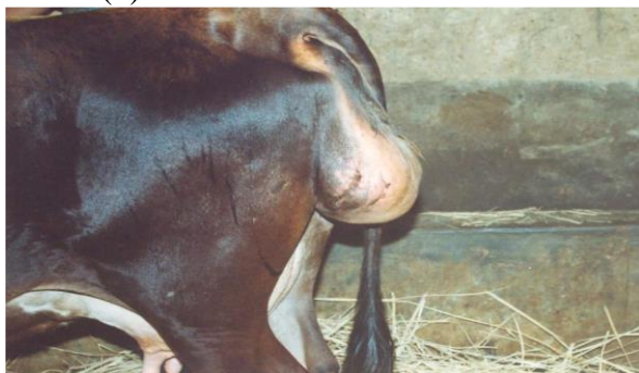
Figure. (2): Show the Perineal hernia (18).

This type of hernia is different from other types that the contents of the hernia doesn't covered by peritoneum, and partly due to the weakness of muscle of perineum making it easier to droop some viscera of the abdominal and pelvic cavity. Usually in Perineal hernia animal has abdominal swelling and brutal space director and in some cases bilateral in perineal area is swollen (17, 18). Contrast studies, either positive or negative, may be helpful and it may have an abdominal shape in a perineal hernia (8).